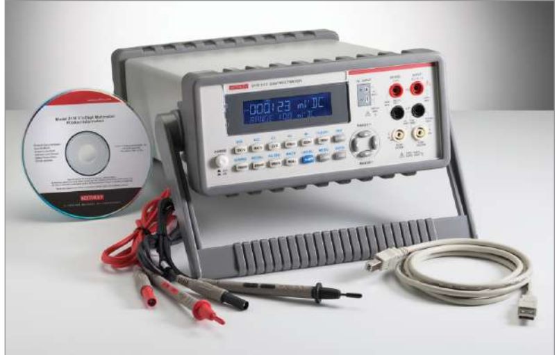
All accessories, such as start-up software, USB cable, power cable, and safety test leads, are included with the 2110.

LabView, IVI-C, and IVI-COM drivers are also supplied to allow for increased flexibility in integrating the 2110 into new and existing systems and test routines.