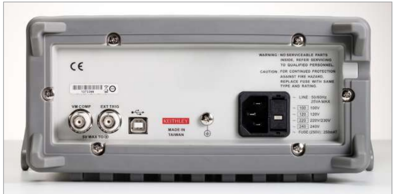
2110 rear panel.