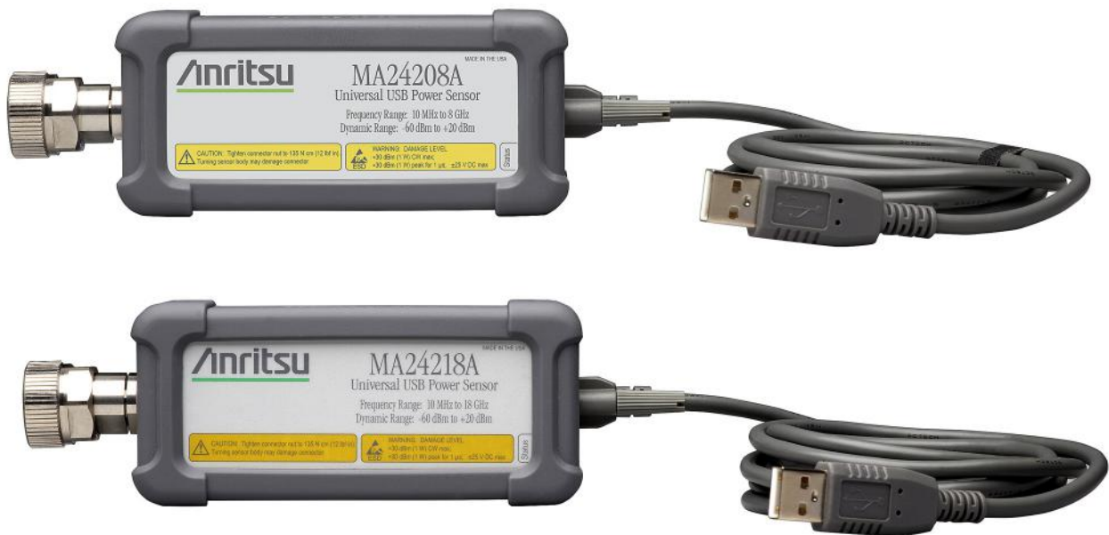
MA24208A and MA24218A Universal USB Power Sensors