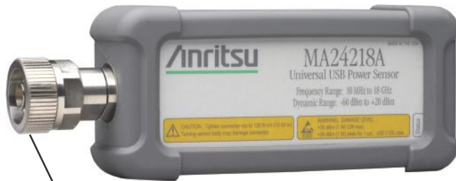
N Type connector designed for use with a torque wrench ensuring repeatable connections