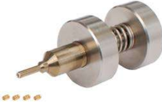
Figure 6: Bullets and Bullet Removal Tool