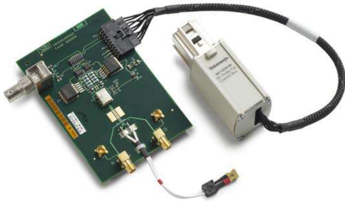
Figure 3: DC Probe Calibration Fixture