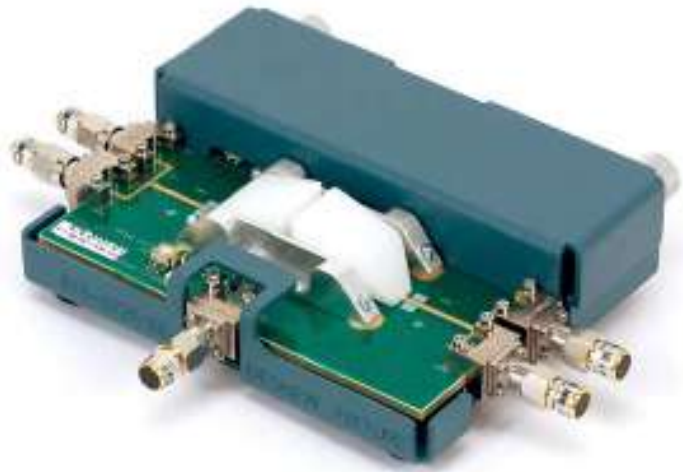
Figure 4: P7600 Series Probes Des skew Fixture