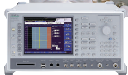
MT8820C Radio Communication Analyzer