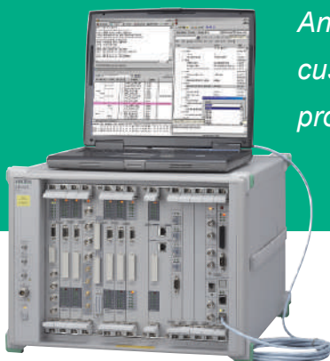
MD8480C W-CDMA Signaling Tester

These return-to-Anritsu service center options enable you to maintain equipment in compliance with ANSI/NCSL Z540-1. Calibrations are done at factory-recommended intervals. When you choose our standard service level, you receive pre-calibration test data for out of tolerance parameters, a certificate of calibration which attests to compliance with ANSI/NCSL Z540-1 and NIST traceability, a calibration sticker indicating the date of calibration and the recommended recalibration date, as well as a free calibration after any repair performed by Anritsu. When you choose our premium service level, you also receive a full set of before-and-after adjustment test data.