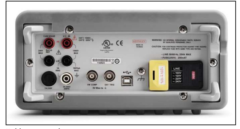
Model 2100 rear panel