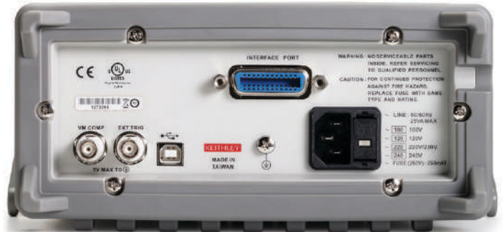
Model 2110 rear panel.

Input bias current: <30pA at 25°C. Input protection: 1000V all ranges (2W input). AC CMRR: 70dB (for 1kΩ unbalance LO lead). Power Supply: 100V/120V/220V/240V. Power Line Frequency: 50/60Hz auto detected. Power Consumption: 25VA max. Digital I/O interface: USB-compatible Type B connection, GPIB (option). Environment: For indoor use only. Operating Temperature: 0° to 40°C. Operating Humidity: Maximum relative humidity 80% for temperature up to 31°C. Storage Temperature: –40° to 70°C. Operating Altitude Up to 2000 m above sea level. Bench Dimensions (with handles and bumpers): 107 mm high × 252.8 mm wide × 305 mm deep (3.49 in. × 9.95 in. × 12.00 in.). Weight: 2.23 kg ( 4.92 lbs.). Safety: Conforms to European Union Low Voltage Directive, EN61010-1. Measurement Cat 1 1000V and CAT II 600V. EMC: Conforms to European Union Directive 89/336/EEC, EN61326-1. Warranty: Three years.