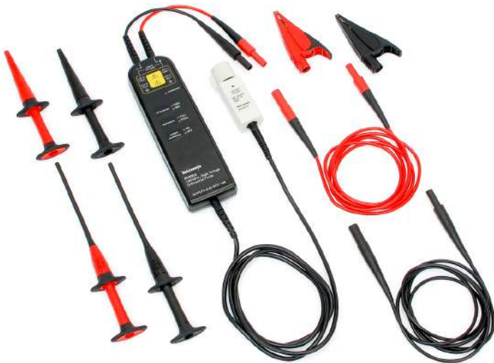
The P52xA Series probes provide high-voltage differential measurement solutions for any oscilloscope.

Probes and accessories are not covered by the oscilloscope warranty and Service Offerings. Refer to the datasheet of each probe and accessory model for its unique warranty and calibration terms.