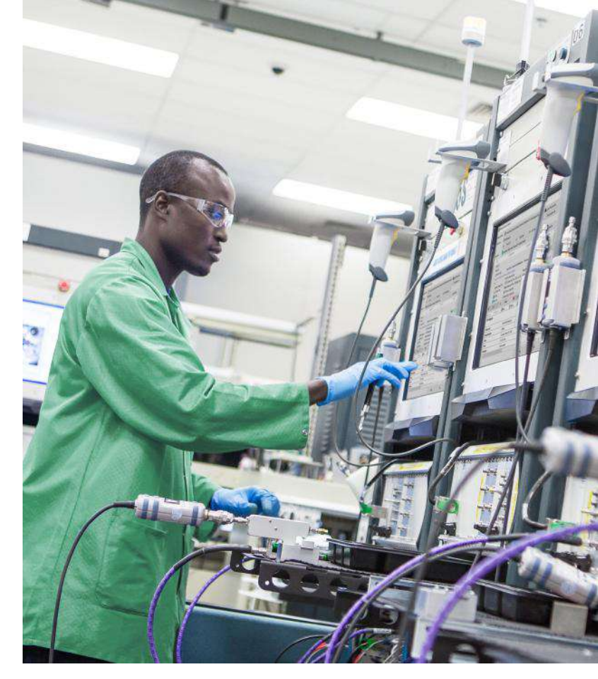
Deploy test sequences with custom operator interfaces with TestStand.

©2023 National Instruments, All rights reserved, National instruments, NI, ni.com, DIAdem, FlexLogger, LabVIEW, and TestStand are trademarks of National Instruments Corporation. Other product and company names listed are trademarks or trade names of the respective companies. Mathworks® and MATLAB® are registered trademarks of the Mathworks, Inc.